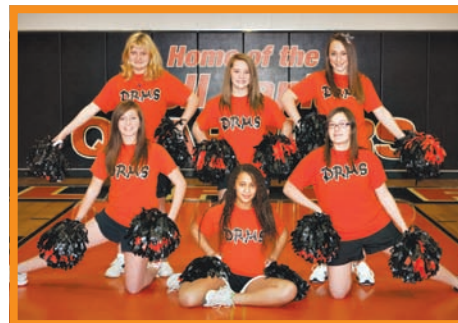
DR 8th Grade Cheer: