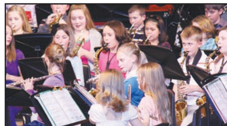
The 5th grade band performing their song with a solo number by the girl in the pink.