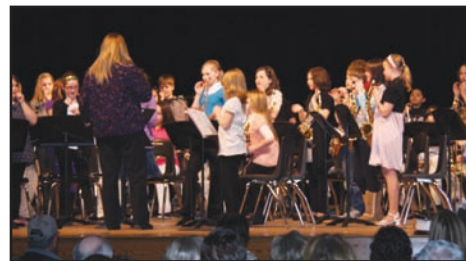
The 5th grade band doing some warm up drills.