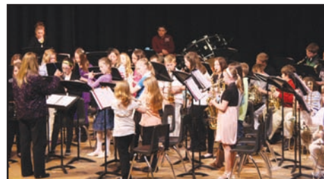
The 5th grade band performing their song.