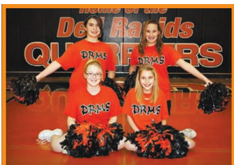
DR 7th Grade Cheer: