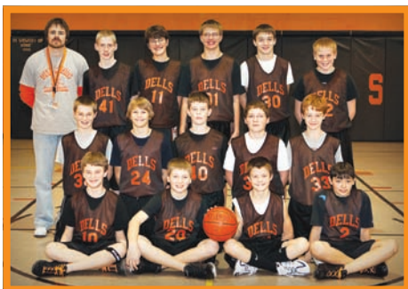
DR 7th Grade Boys Basketball Team: