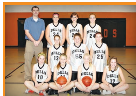
DR 8th Grade Girls Basketball Team: