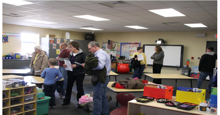
Students happily show their parents around the Kindergarten classroom during the Open House held on Feb. 12, 2012.