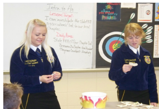
State Chapter FFA Officers visited the classroom to present workshops on the Introduction to Ag.