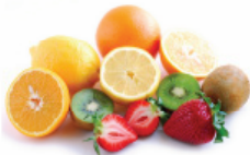
Fruit or Juice Available Every Day Start your day off right