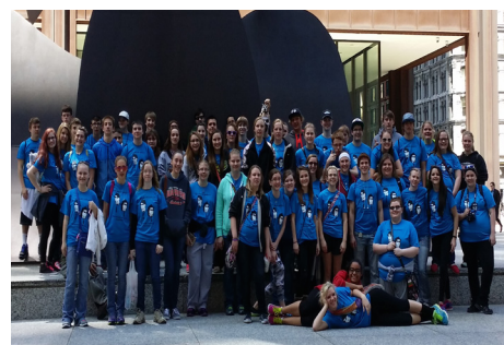
Band and Choir members gather in front of the "Bean" for a memorable group shot.

At 8:00 the next morning, everyone boarded the bus once again, and started to make their way home back home. It was a trip enjoyed by all and many great memories were made.