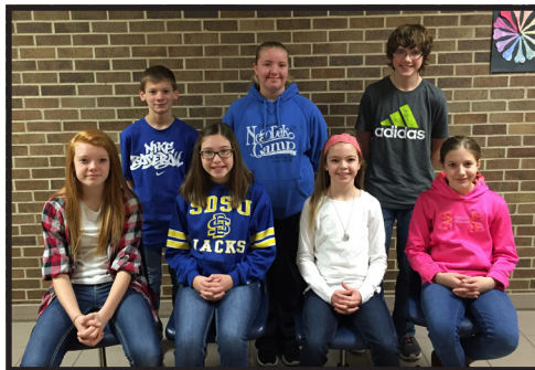
Congratulations to our December Students of the Month: