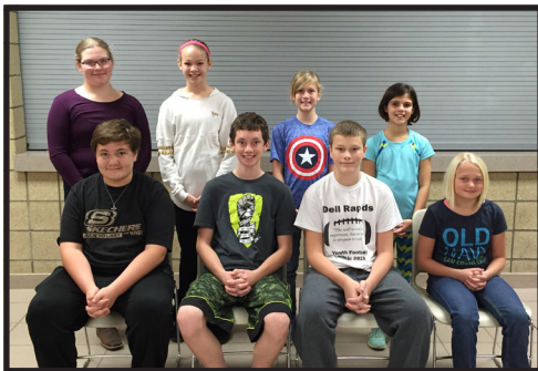
Congratulations to our November Students of the Month:

These individuals have demonstrated positive behavior reflective of the Pillars of Character: trustworthiness, responsible, respectful, fair, good citizenship, and are caring individuals. Thanks to Lunchtime Solutions, Video Plus and Pizza Ranch, Students of the Month recipients will receive gift certificates for these places!