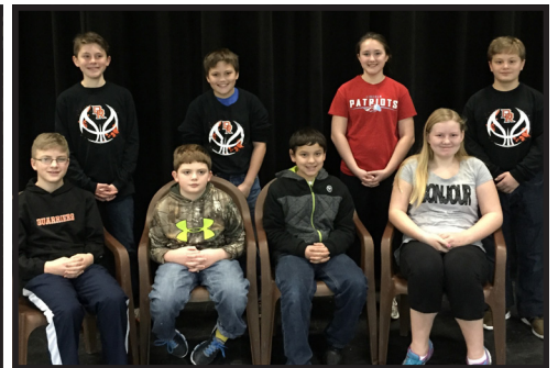
Congratulations to our January Students of the Month: