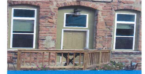
JOHN JACKSON 403 B E 4TH STREET (ALLEY ENTRANCE)