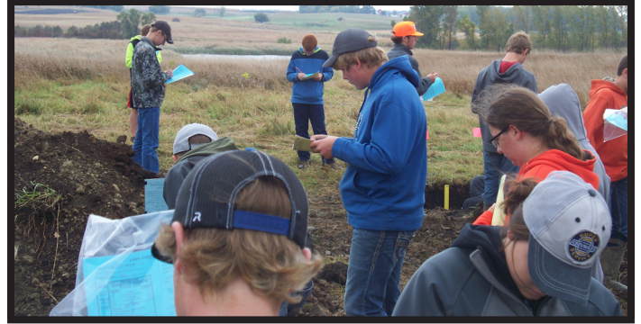
Students checking properties of soil.

the Outdoor Campus in Sioux Falls on Oct. 25 allowed students to experience fishing. The semester will wrap up with students connecting the various career opportunities in wildlife and fisheries management.