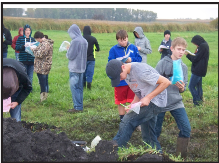
Students checking properties of soil.

Various shop projects were constructed by the Advanced Ag Mechanics students during the first quarter which ended on Oct. 27. The nine students had taken previous mechanical classes and were able to apply their skills in constructing or fixing projects. Some of the projects included constructing four wooden cattle feed bunks, installing new flooring on two utility trailers, constructing a wooden storage box and fixing a patio glider. The second quarter has twenty students enrolled in Ag Processing Technology. The processing of various agriculture products will be the main emphasis of this class. Dairy processing has students analyzing the quality factors of dairy products including fluid milk, butter, yogurt, cheese and ice cream. Using a hand-crank butter churn from the Old Courthouse Museum, the class will make home-made butter and sample it. Ice cream will also be made during class using an electric ice cream maker. The slaughter process, quality grading, yield grading and inspection are all parts of the meat processing unit. A field trip to tour John Morrell usually occurs