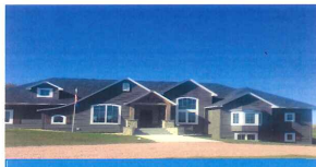
JON & SHEILA HANSEN 47484 DELLS DRIVE