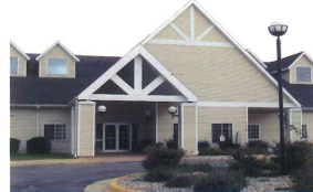
SANFORD ORCHARD HILLS 200 W 10TH STREET