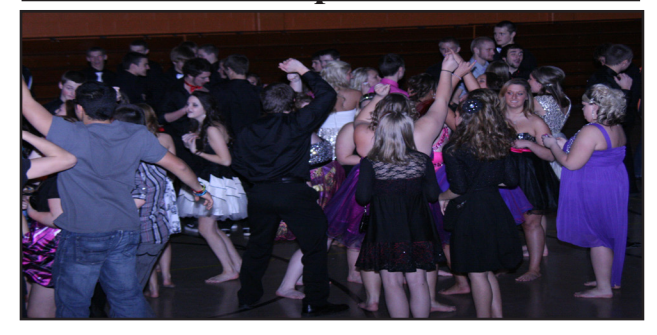
The night was filled with color and movement as many high school students took to the dance floor for Winter Formal 2013.

with "When You're Smiling" written by Tom Kubis. This medium swing chart was a great opener for the band as they transitioned into the next song "Blues Around the Corner" by Rick Cornish. This difficult and upbeat tempo was a fantastic selection for the band and featured many soloists. The students spent a large portion of their day practicing this selection, as it tested their time, rhythm, and improvisation. The next song the Jazz Band played was "Round Midnight", a saxophone feature cowritten by Theolonius Monk and Cootie Williams. In a short given time, the students worked hard to come in on the right cues and develop better sight reading skills. The Jazz Band closed with "The Road Not Taken" written by Darren W. Jenkins. This bubbly piece worked well to please the crowd as the concert moved to the next performance.