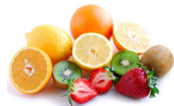
Fruit or Juice Available Every Day