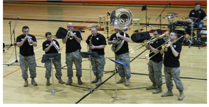
The SGT. Rock Band kept the students spirits up with up with high energy music, songs, and crowd participation the day before Spring Break.

On Wednesday, Feb. 12, 2014, Dell Rapids high school and middle school students received some special visitors. The 147th Army Band, SGT ROCK, performed some of today's pop music, as well as some classic rock hits in an assembly. They are also a part of the regular Arny and informed everyone of what they do for their unit and civilians daily.