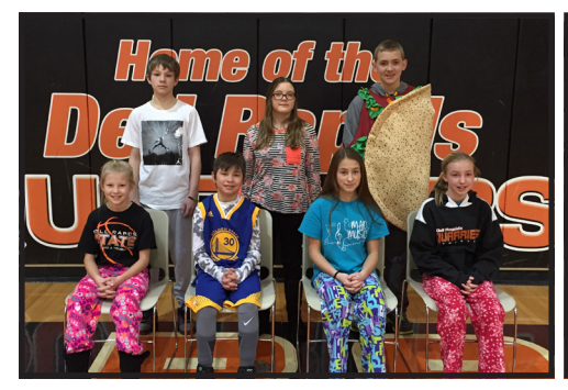
Congratulations to our February Students of the Month:

These individuals have demonstrated positive behavior reflective of the Pillars of Character: trustworthyness, responsibility, respectfulness, fairness, good citizenship, and care for others. Thanks to Lunchtime Solutions, Video Plus and Pizza Ranch, Students of the Month recipients will receive gift certificates!